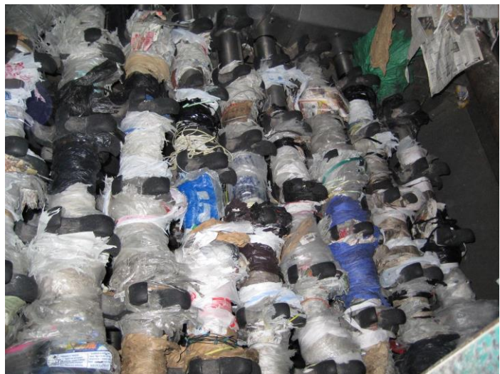
Plastic bags tangled in the sorting machinery

Non-collectable items, such as plastic bags, are too often mixed into curbside recycling. A list of accepted items is available at www.duncan.ca/garbage-recycling .