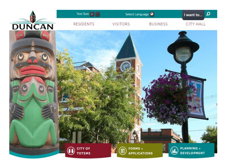
Check it out at www.duncan.ca

In July, the City launched a fresh, bold new website that reflects the vibrancy of the community. Thornley Creative Communications helped to develop the new site with residents, visitors and local business' in mind. It's much more user friendly with a fully responsive design for desktop and small screen devices such as mobile phones or tablets.