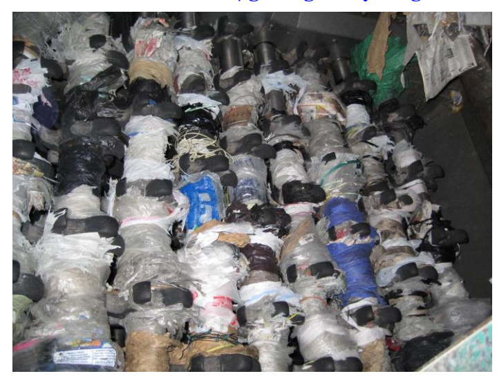
Plastic bags tangled in the sorting machinery

Non-collectable items, such as plastic bags, are too often mixed into curbside recycling. A list of accepted items is available at <a href="https://www.duncan.ca/garbage-recycling">www.duncan.ca/garbage-recycling</a>.