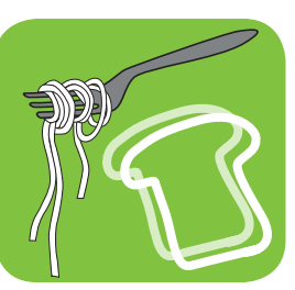
rice, pasta, baked goods