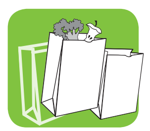
paper bags made of 100% natural fibres