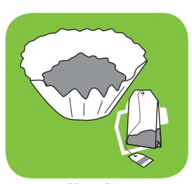
coffee filters, tea bags