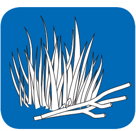
grass cuttings and branches