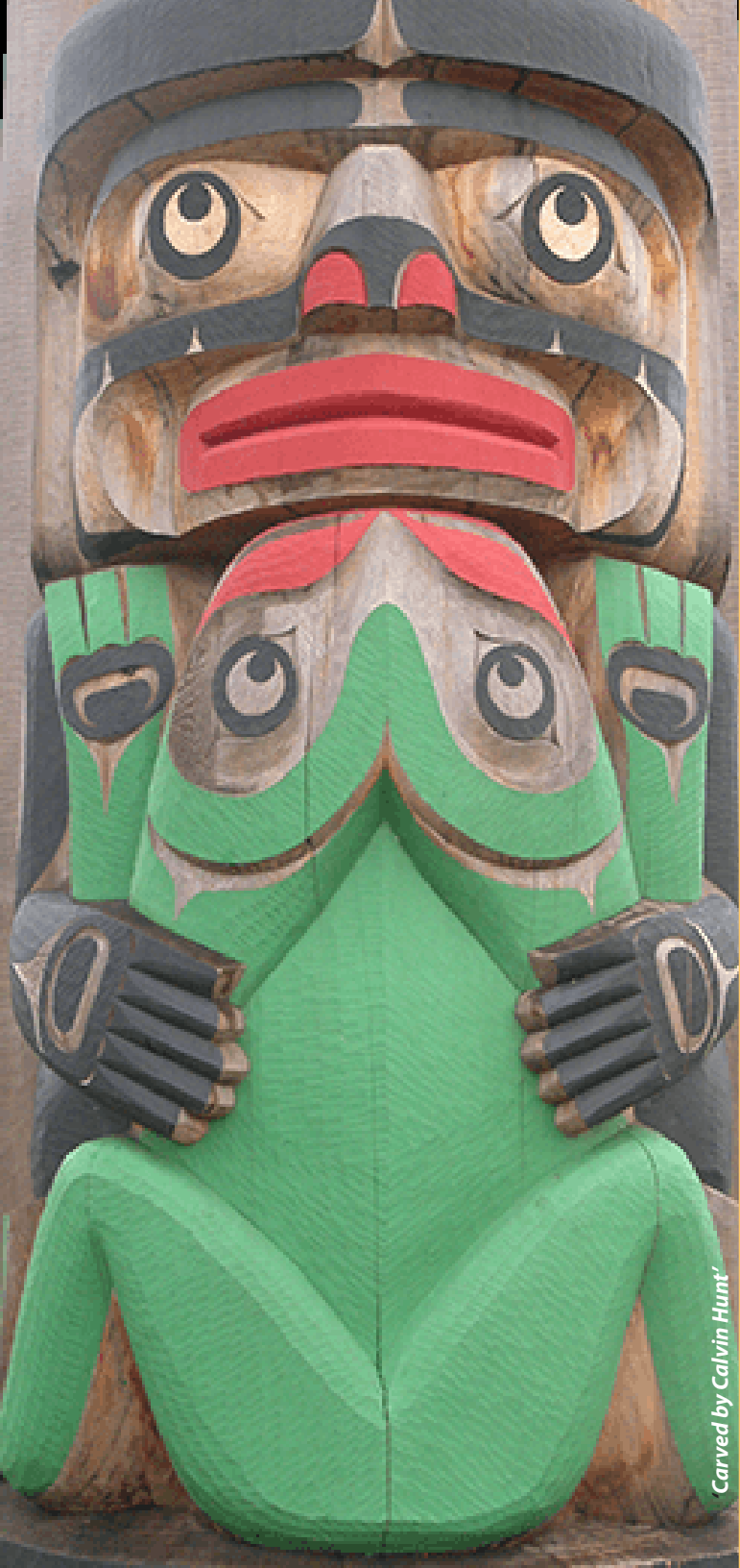
Carved by Calvin Hunt