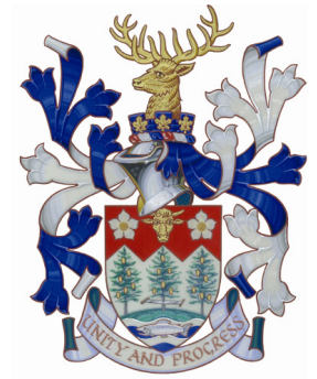
CITY OF DUNCAN