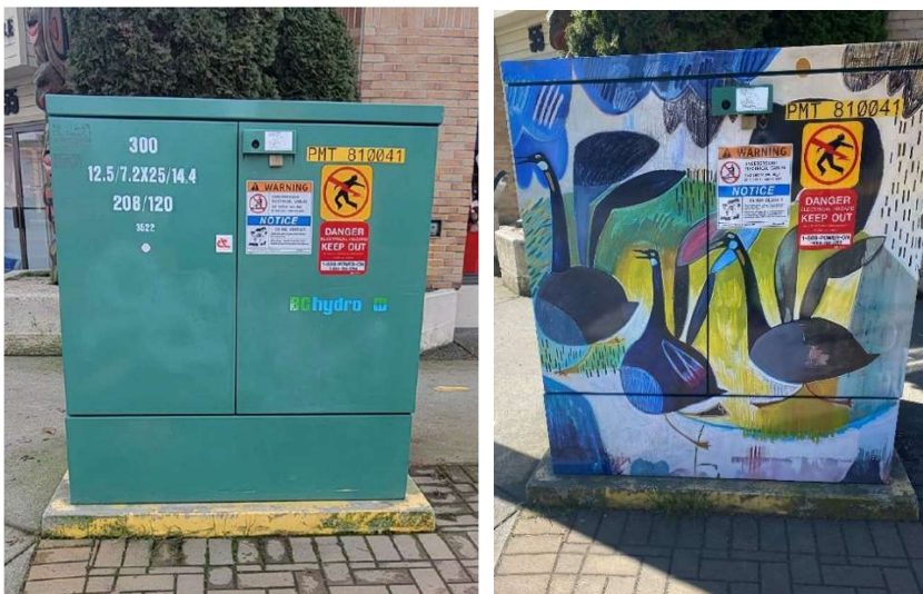
Duncan B.C., Broo Ha! Ha!