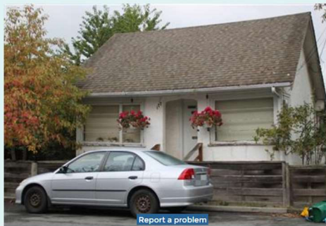
Report a problem