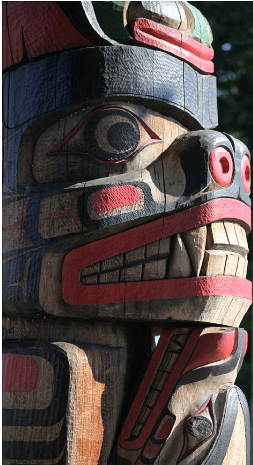
Carved by Richard Hunt