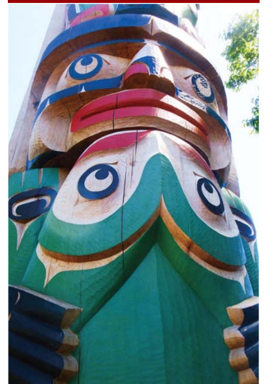
Carved by Calvin Hunt