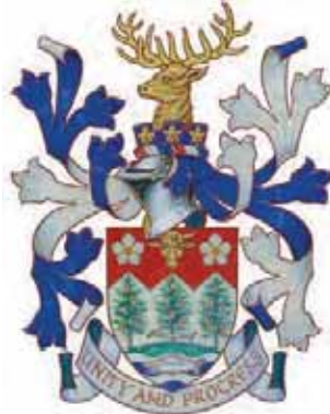
CITY OF DUNCAN